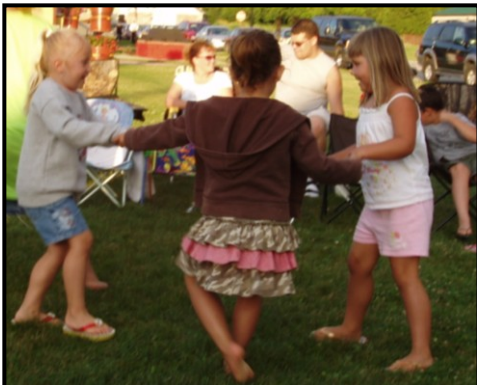
Even the kids enjoyed the music.