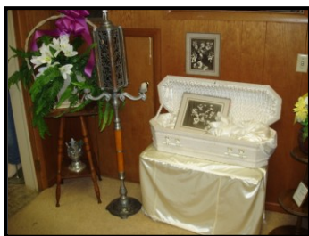
The Funeral Room

Lucille: I am old enough to relate to a lot of local history.