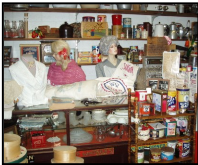
The General Store Exhibit

I attended Blue star School, a one room, eight grade school on Ballard Road, the same school my father attended. I worked on the election board in the old city hall on Main St. when tallying was done by pencil on a large sheet of paper.