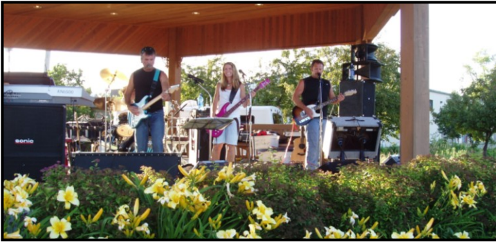
The gazebo, surrounded by flowers, makes a great entertainment venue.